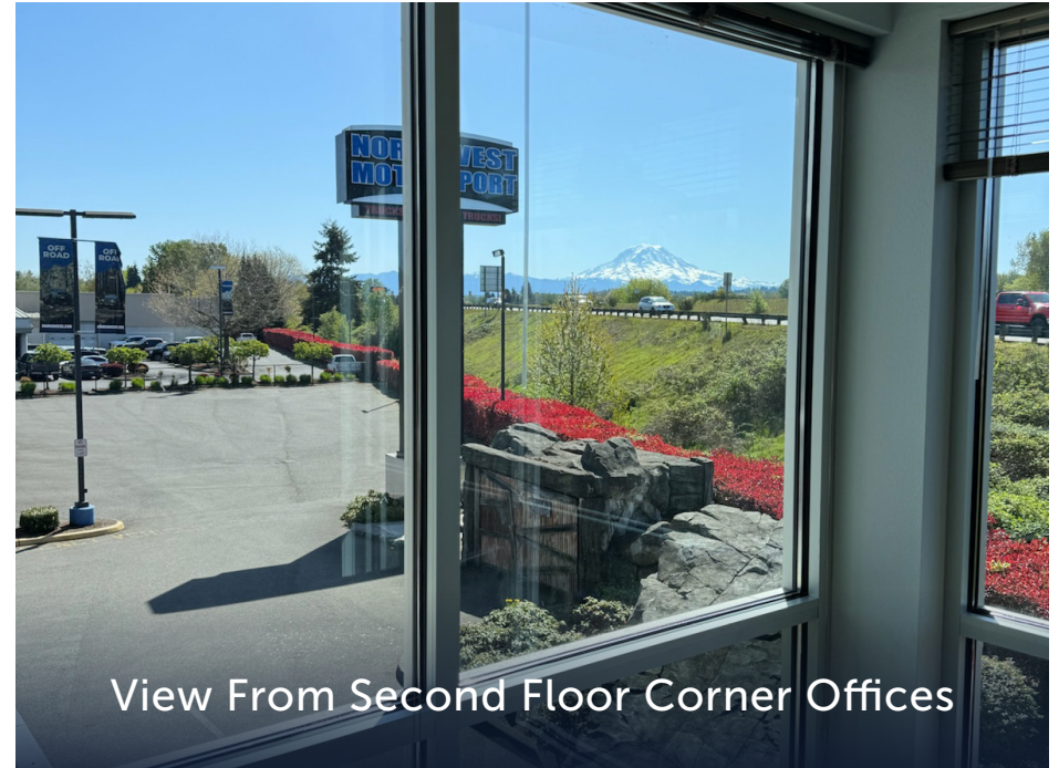
View From Second Floor Corner Offices